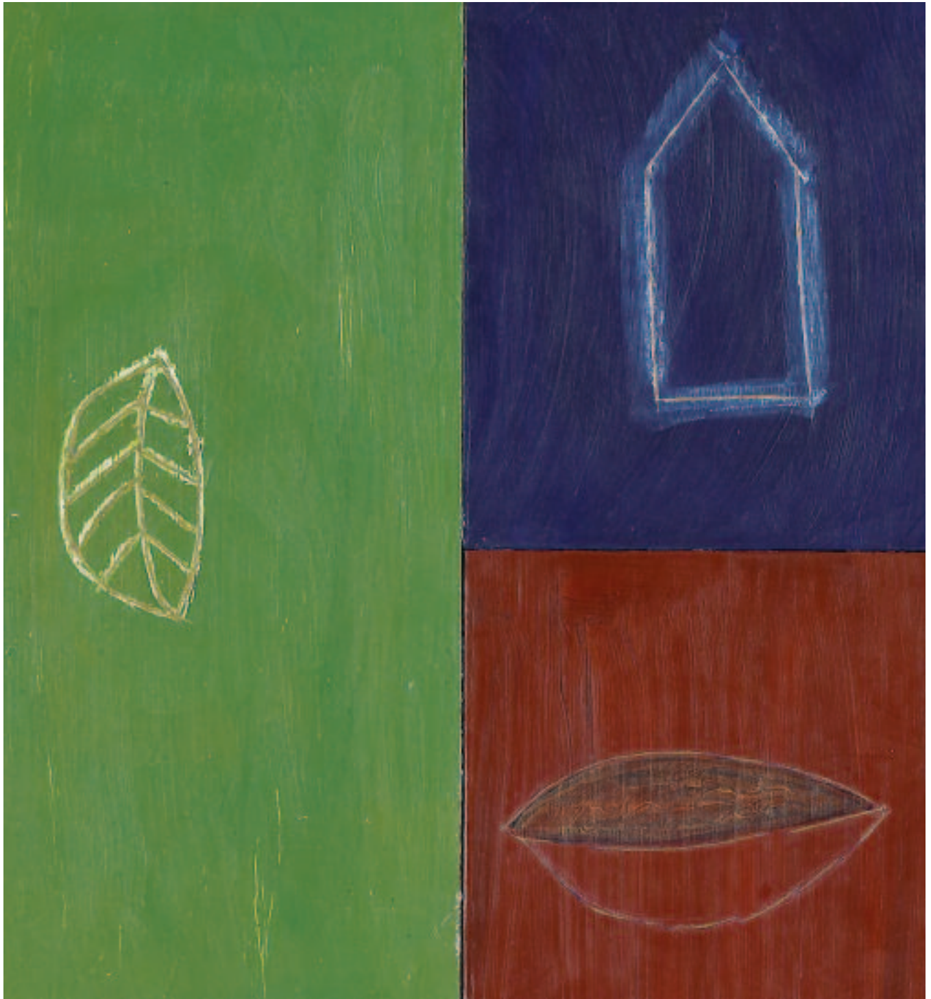
Camille J. Gage | 2002, mixed media